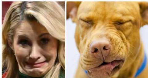
SIDELINE REPORTER & CANINE RIPSNOTER LAURA RUTLEDGE PIT BULL

THE INDIANA COACHES COLLECTION THE VERMONT POLITICIANS COLLECTION