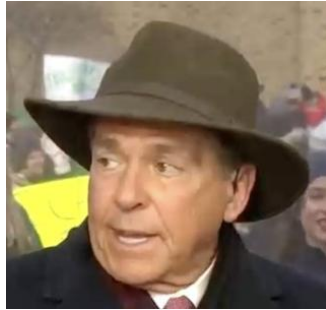
Alabama Jones and the Odor of Mendacity

It's the Most Wonderful Time of the Year. Can't wait for New Year's Day to see what happens next.