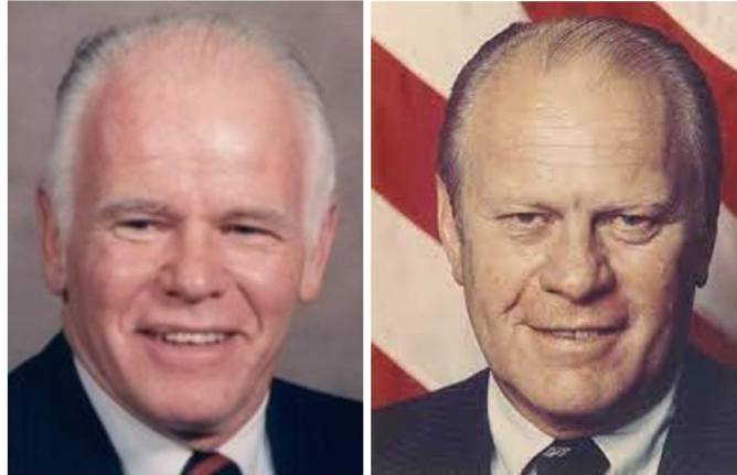
HIP GYRATIONS, WOW! & WHIP INFLATION NOW BILLY WADE GERALD FORD

THE COMPLETE SEPARATED@BIRTH? COLLECTION THE WATERGATE COLLECTION THE U.S. PRESIDENTS COLLECTION