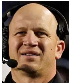
Fulton County Jail Mug Shot of the Week

THE COMPLETE SEPARATED@BIRTH? COLLECTION THE WATERGATE COLLECTION THE U.S. PRESIDENTS COLLECTION