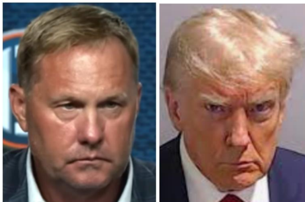
NEVER CONTENDER & NEVER SURRENDER HUGH FREEZE DONALD TRUMP

THE COMPLETE SEPARATED@BIRTH? COLLECTION THE AUBURN COACHES COLLECTION THE MASSACHUSETTS POLITICIANS COLLECTION