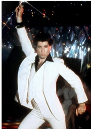
& SATURDAY NIGHT FEVER JOHN TRAVOLTA