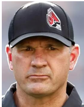
Fulton County Jail Mug Shot of the Week

THE COMPLETE SEPARATED@BIRTH? COLLECTION THE CURB YOUR ENTHUSIASM COLLECTION THE MICHIGAN COACHES COLLECTION