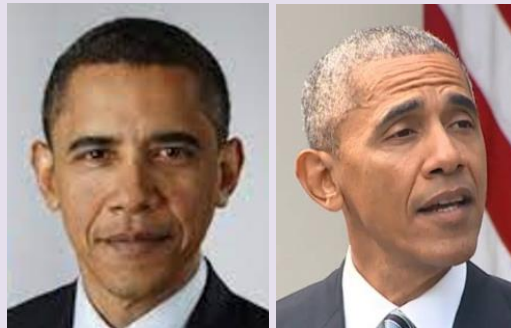
Before 2008 & After 2016