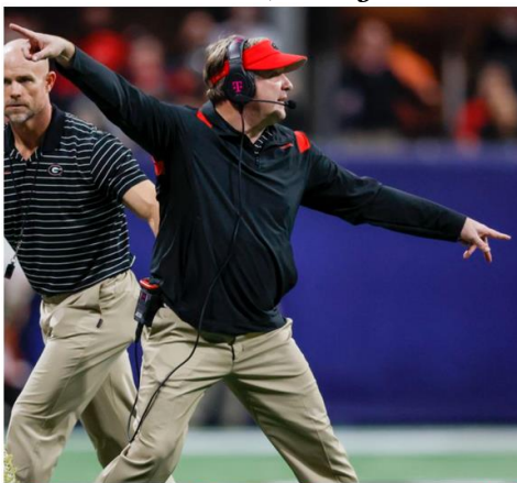
SATURDAY NIGHT BELIEVER KIRBY SMART

Meanwhile, Kirby Smart rocks it Old School