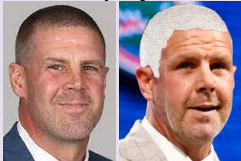
Before 2022 & After 2023 Game 1

How much is Billy Napier's buyout? Gators are stuck with him