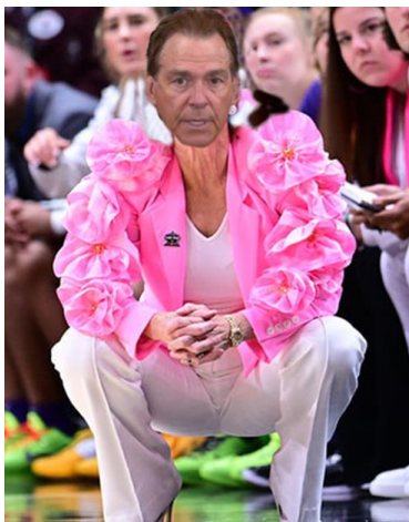
Trying to restore Alabama’s program to glory, Nick Saban goes full Kim Mulkey to bring back the Tide Mojo

Meanwhile, Kirby Smart rocks it Old School