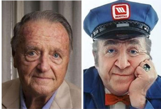
FSU & FU's BOBBY BOWDEN & MAYTAG REPAIRMAN THE COMPLETE SEPARATED@BIRTH? COLLECTION THE BOWDENS COLLECTION