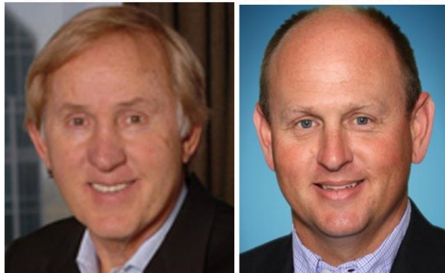
NATCH, NO SACK & HATCH ATTACK FRAN TARKENTON & CHRIS HATCHER THE DAWG QB COLLECTION THE GEORGIA HS QB COLLECTION

Finally, many skeptical Dawg fans got what they wanted. In the third quarter, Kirby Smart yanked Stetson Bennett and replaced him with Carson Beck.