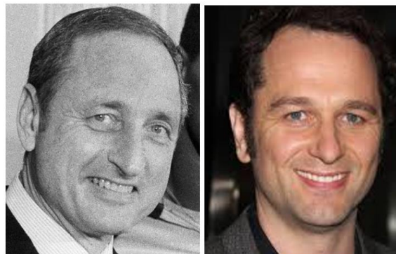
GREAT PERSUASION & PERRY MASON VINCE DOOLEY & MATTHEW RHYS