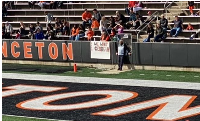
Fans of 7-0 Princeton state their case for the playoff

And be careful about putting a rope in Florida fans’ hands these days. They might have other ideas on how to use it.