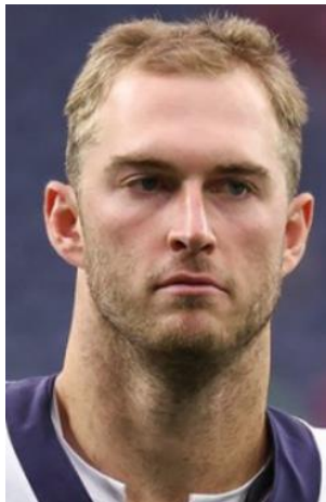
A FRICKIN' NECK & DAVIS MILLS

Former Greater Atlanta Christian and Stanford QB Davis Mills got national exposure after replacing injured starter Tyrod Taylor of the Houston Texans, and most of the attention went to his remarkable neck. After extensive investigation, I learned why.