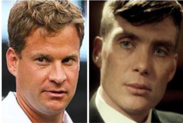
CHEEKY SLIMER & PEAKY BLINDER LANE KIFFIN TOMMY SHELBY