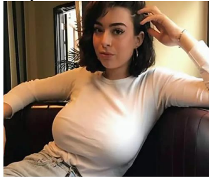
Man decided to file for divorce after he took a closer look at this photo!

We've all seen this click-bait a hundred times at Dawg-themed websites. Spoiler alert: It was only then that he realized they were fake.