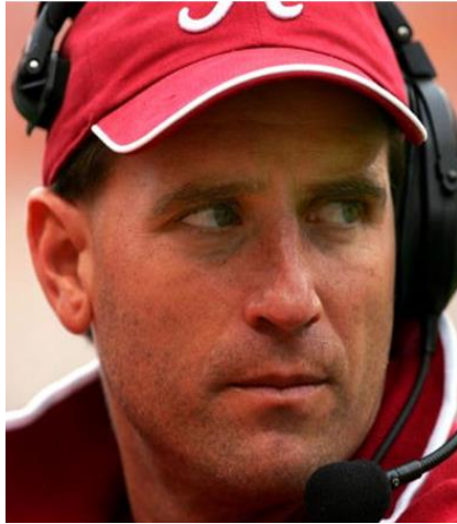
THE AWFUL MIKE SHULA