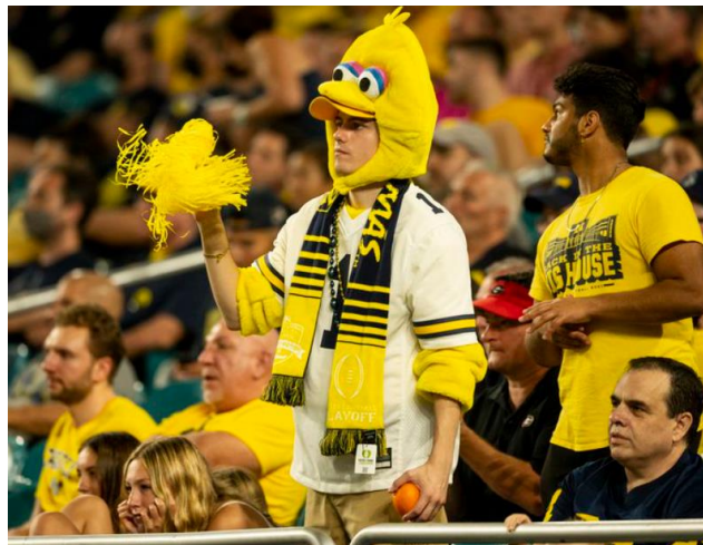
Go Big Blue.

The game then began, and the narratives took a beating. Earlier in the day, one of the broadcasters noted that Cincinnati just doesn't see body types in the American Athletic Conference like the ones in the trenches for Alabama. In the evening game, it seemed clear that Michigan doesn't see athleticism and speed in defenders, or power and execution in the offensive line, close to what they came across against Georgia.