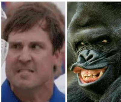
SCYLLA & MAGILLA WILL MUSCHAMP & GORILLA