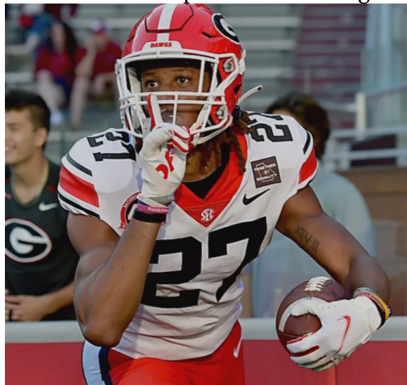
Eric Stokes silences empty Razorback Stadium after pick-six

The story arc for this season? It's still being written. How it turns out depends on what happens in practice, when the fans aren't watching and dreaming up scenarios and calling plays the coaches should have called. They'll still dream up those scenarios; Stetson Bennett's job is already in jeopardy in the minds of the fans; and the coaches aren't anointing anyone yet for the long haul. Although it's almost October, we've got a long way to go, and the authors of the script are still working out the details.