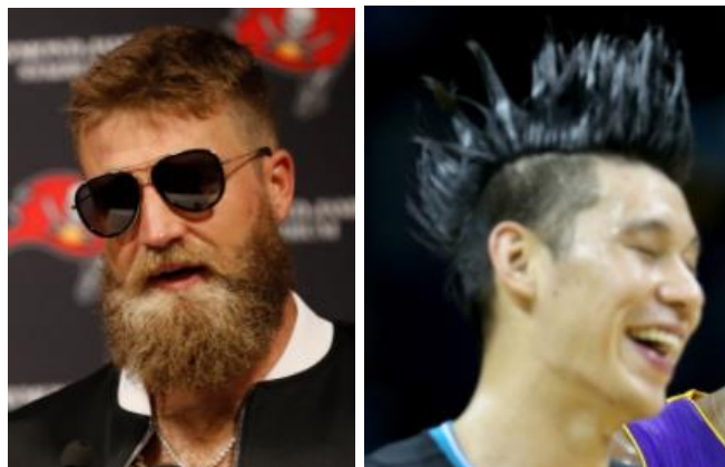
Here's what happens if you let your son go to Harvard

Speaking of Harvard, when President Trump delivered the commencement speech at the summer Harvard graduation ceremony, the crowd chanted, "Eschew his presidency!" Damn anarchists.