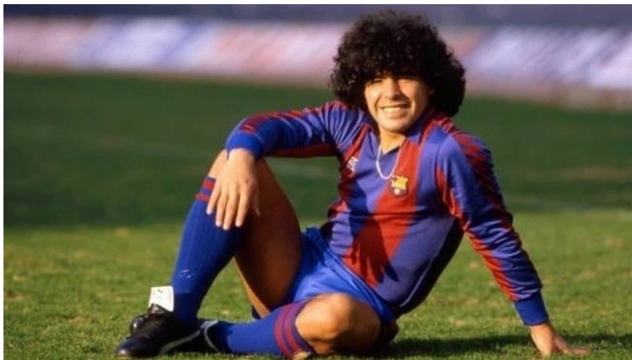
Diego Maradona, R.I.P.