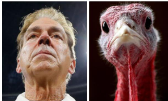
NO PRANKS NICK SABAN