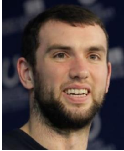
& QUIT WHILE AHEAD ANDREW LUCK