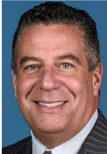
& OFFENSIVE YAHOO BRUCE PEARL