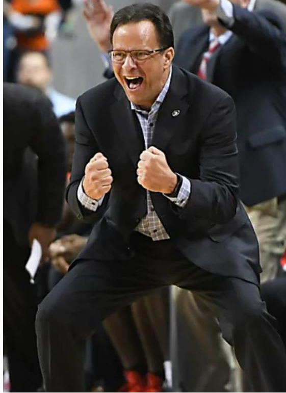
Tom Crean reacts to news of the Todd Monken hire

Yes, that's the big news this season: the change in offensive philosophy and attack in the form of Todd Monken. The shiny new object always gets all the attention. But this team will once again be in every game because of the defense, a unit that is deep with talented, coachable athletes who understand that the goal is to stop the opponent rather than to build a statistical case for individual glory.