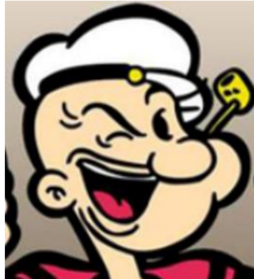
SAILOR MAN POPEYE