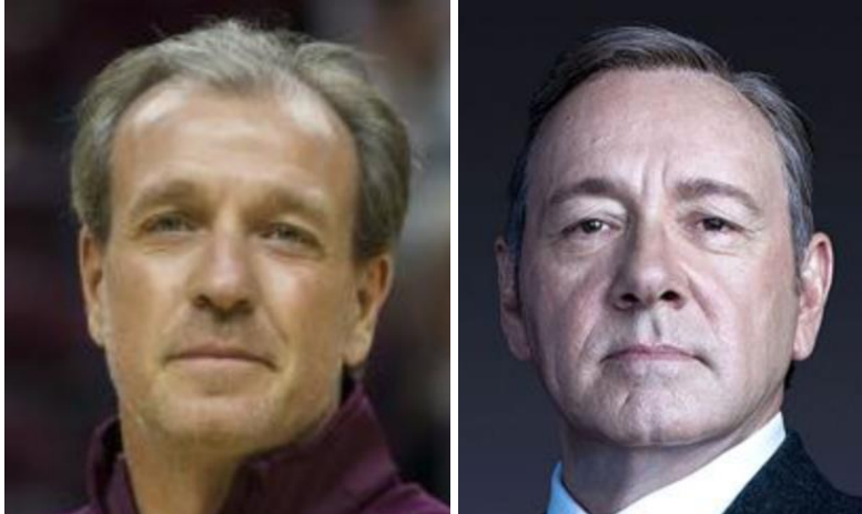
NOLES TO AGGIES JIMBO FISHER