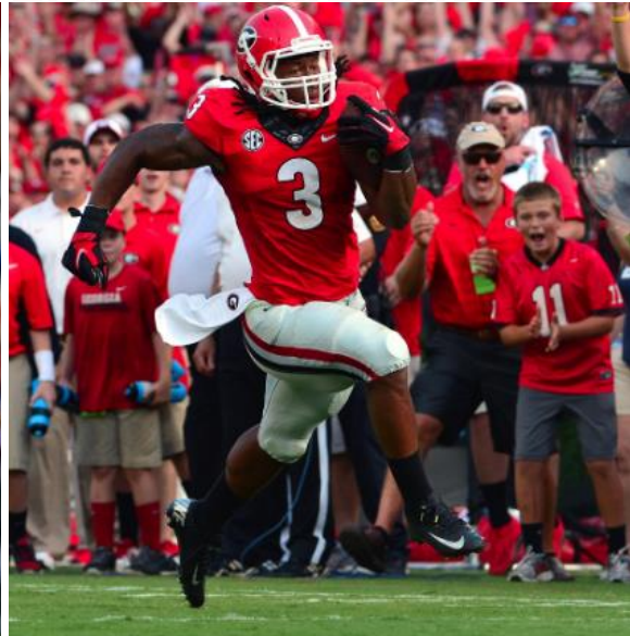
& DRINKS GATORADE TODD GURLEY