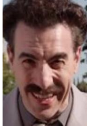
& SPOKESDORK FOR KAZAKHSTAN BORAT