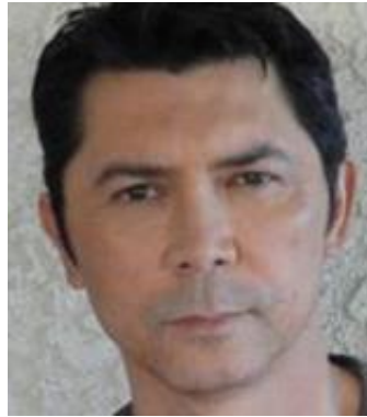
& SCENERY CHEWER LOU DIAMOND PHILLIPS