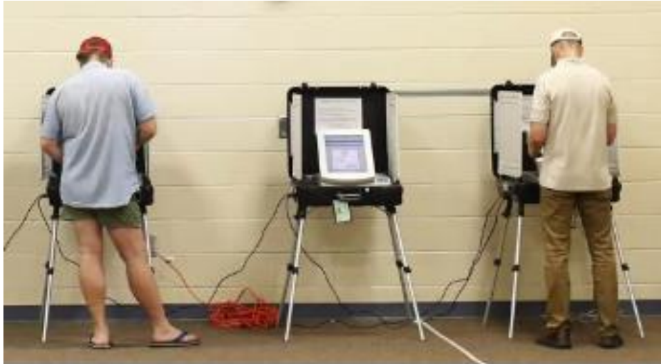
In an annual ritual, voters urinate on ballot boxes