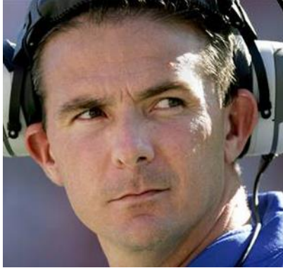
BEAN HER ESCHEW HER URBAN MEYER