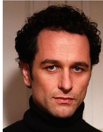
& KGB MATTHEW RHYS