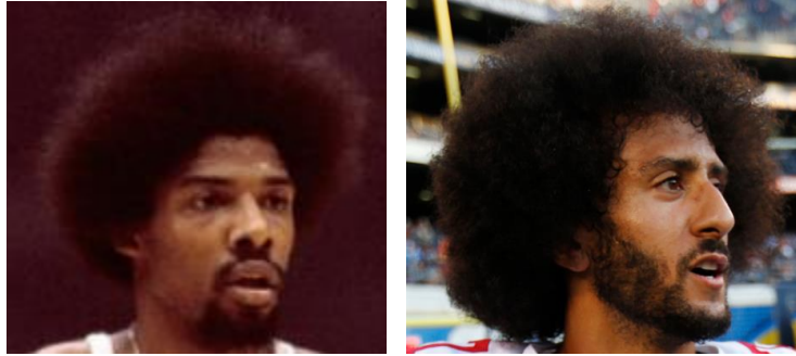
TAKES A 3 DR. J