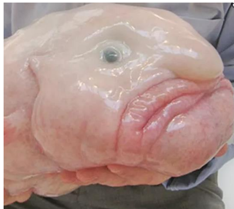
PLEASE BURY, OH BOY BLOBFISH