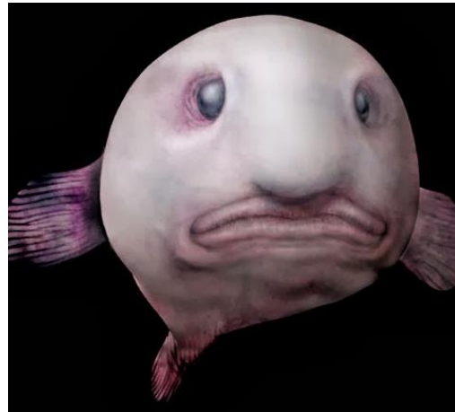
LORD WHAT A STINKY THING BLOBFISH