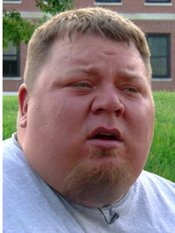
LORD OF THE RING-DINGS JARED LORENZEN