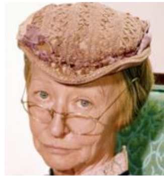
BEVERLY HILLBILLY GRANNY