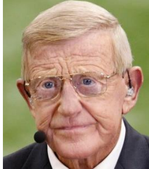
NEVER HE'LL & SKILLFUL BE LOU HOLTZ