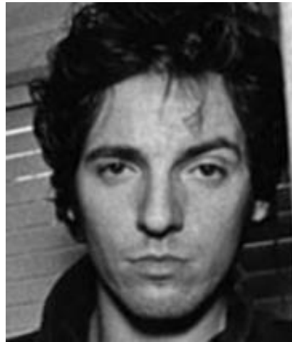
BOSSY CROONER BRUCE SPRINGSTEEN