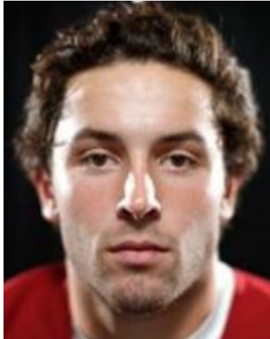
SAUCY SOONER BAKER MAYFIELD