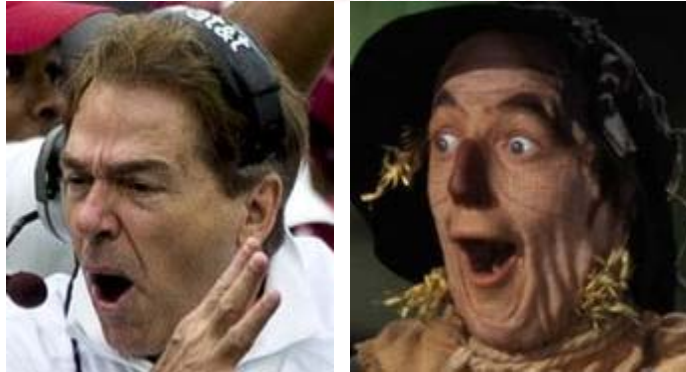
NAPOLEON COMPLEX NICK SABAN