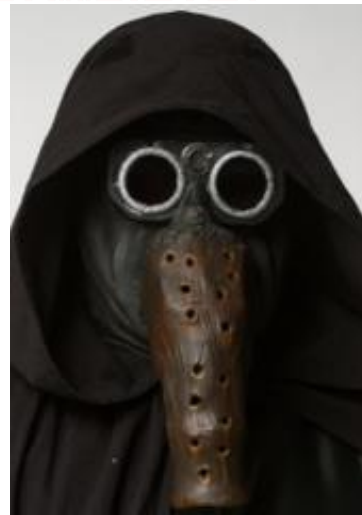
MOS' EASILY HIGH LARAMIE TUNSIL