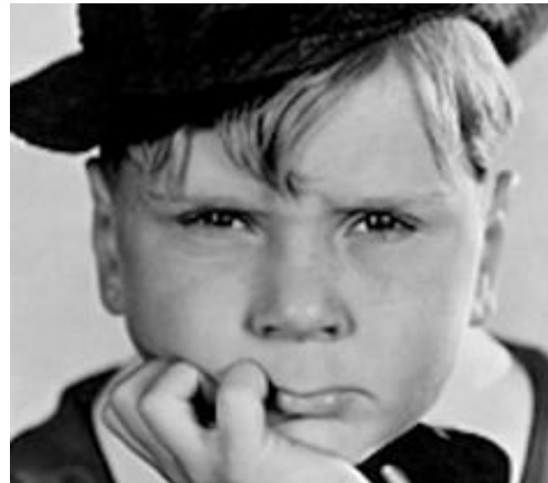
& SMOOTHER THAN A FRESH JAR OF SKIPPY JACKIE COOPER