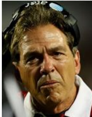
CEASELESSLY & CIRCUMSPECT NICK SABAN