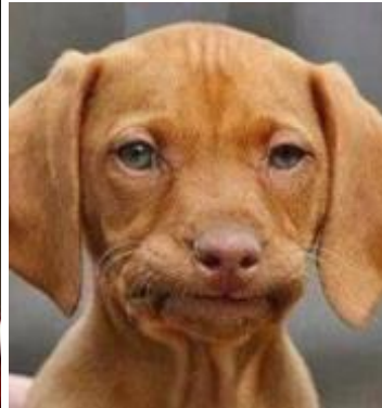
RECENTLY CIRCUMCISED HOUND DOG