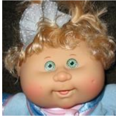
CABBAGE PATCH KID

Nothing to add here to the universal consensus that we got our asses kicked on Saturday in every component of the game. A historically bad day for the program, and if you saw it, or read the news and opinions on Sunday, you know as much as I do and more or less think the same thing.