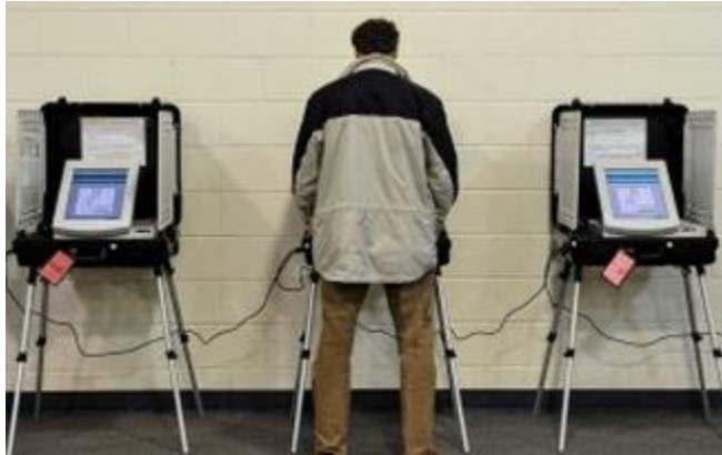
After watching 3 months of candidates' attack ads, disgusted citizen urinates on voting machine