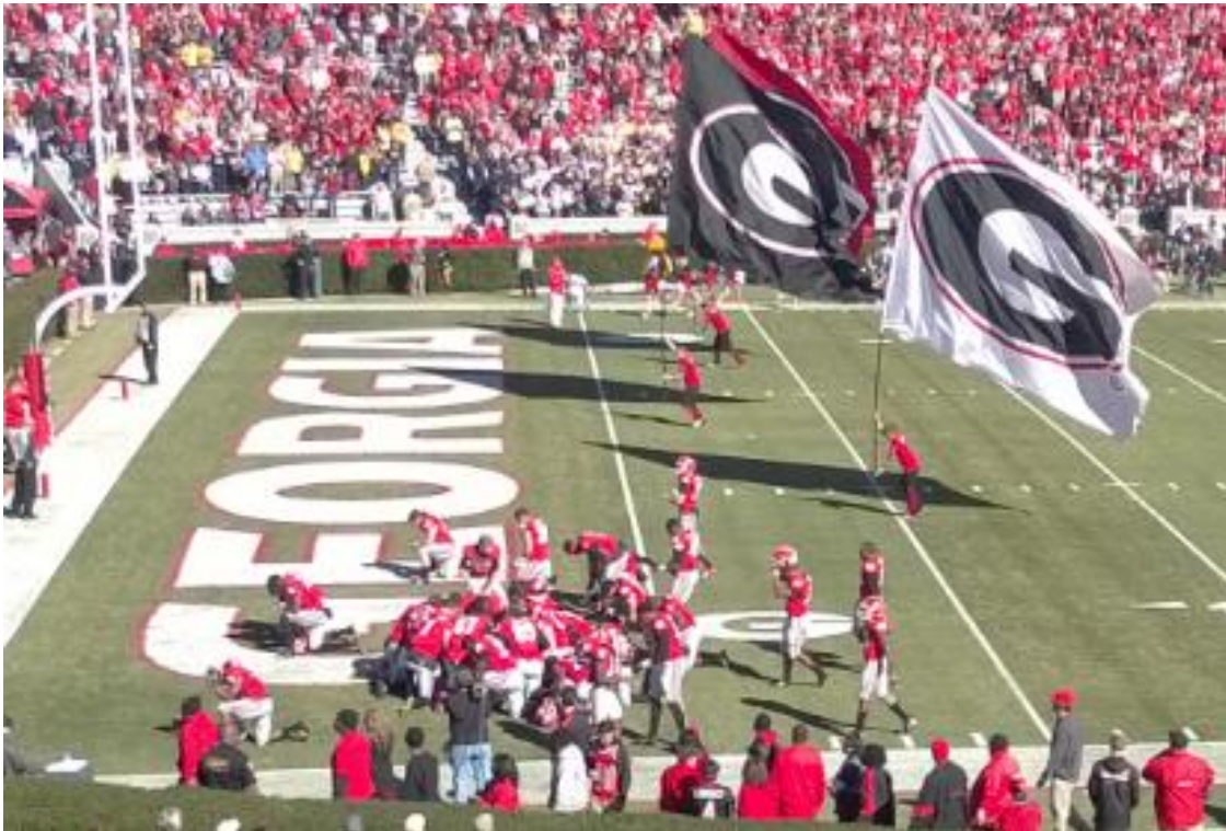
Dawg players looking for lost contact lens before Georgia Tech game

“[Black children are given] names like Shaniqua, Taliqua and Mohammed and all of that crap, and all of them are in jail. . . . People used to be ashamed. Today a woman has eight children with eight different ‘husbands’ – or men or whatever you call them now.” ~ Bill Cosby, noted Family Values authority